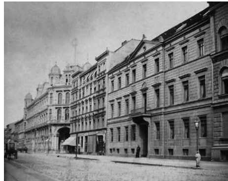
Figure 3. Behrenstrasse 48, 1874.