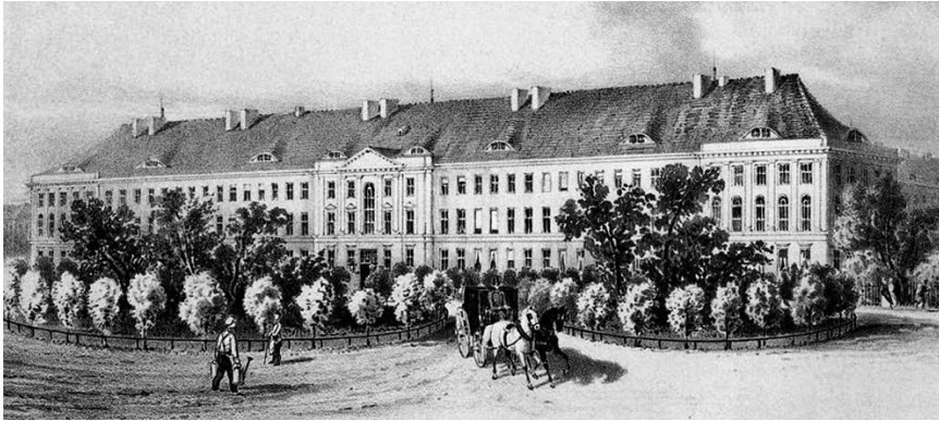
Figure 6. Charité Hospital around 1850.

semester of 1868/1869 in his own private eye clinic and he moved during the summer semester in 1869 to the Charité and gave the official lectures there. The examinations in ophthalmology became an essential part of the medical requirements in 1868. 26