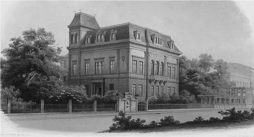
Figure 4. Viktoriastrasse 34, a house where A. von Graefe lived from 1868 and died in 1870.