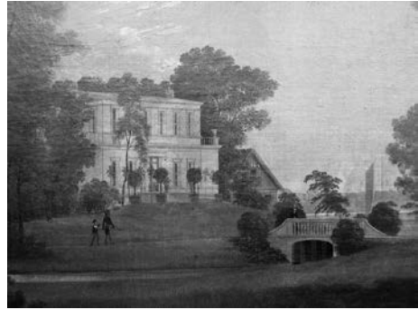
Figure 2. Villa Finkenherd, a view from the south-east, 1839.

From 1866 to 1868, he lived with his family in a vast and nice house in Bellevuestrasse 16. It was called the Casper House, built in 1837 by the architect Eduard Knoblauch (1801-1865). 16 The building was demolished, and on that place in 1912 was built the north-west wing of the Esplanade Hotel.