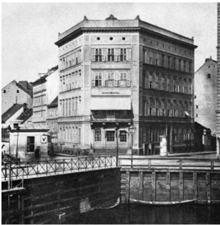
Figure 5. Graefe's private eye clinic at Karlstrasse 46 in Berlin, before 1870.*