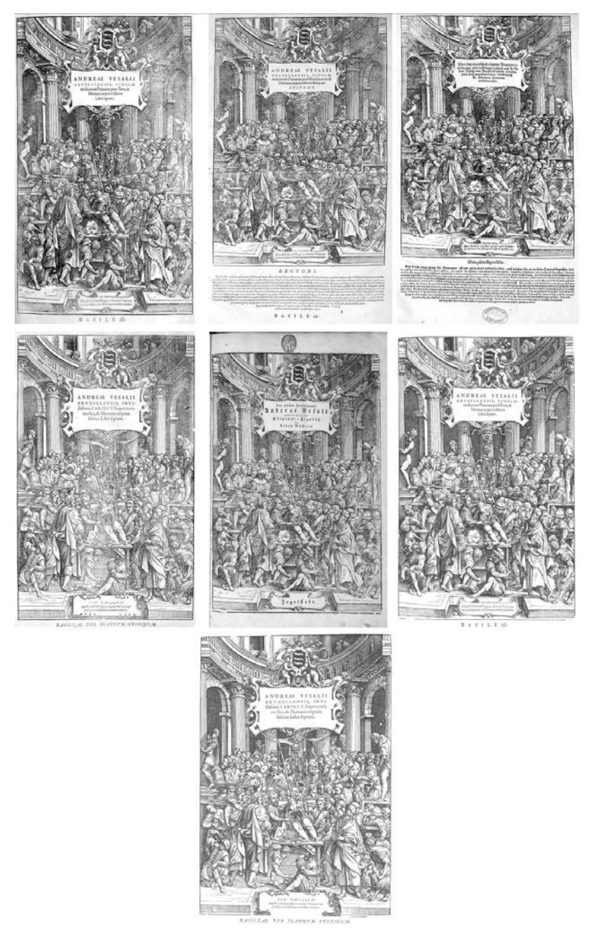
Figure 2: Images of the woodcuts printed from woodblocks of the Frontipiece. From left to right, upper then lower: Fabrica of 1543, Epitome (Latin) of 1543, Epitome (German) of 1543, Fabrica of 1555, Leveling of 1783, Bremer of 1934 (from Fabrica of 1543) and Bremer of 1934 (from Fabrica of 1555).