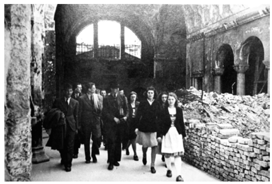
Figure 7: University Library of Munich (Phot. 29), 1946.

To protect these interesting volumes, rare manuscripts, and early prints, they were all stored in the basement of the north wing. In the air attacks of 1943 through 1945, the LMU Munich Library lost 350,000 of its 1,100,000 books, those salvaged having been transferred out. On 13 July 1944, about five hundred B-17 bombers of the Eighth United States Air Force attacked Munich, and most of the university buildings were burned. The upper floor of the north wing collapsed, but the basement was spared for three days. On 16 July, another attack of some two hundred B-17s hit the city again, and two high explosive bombs set the foundation on fire, incinerating the contents of the basement of the north wing. In the rubble lay the ashes of ninety thousand volumes that had not been sent away, various catalogs, and a curious combination of documents and artifacts, probably intended for Kirchner's exhibitions. These included a portrait collection, correspondence of Leibnitz, manuscripts of the Upper Bavarian Document Collection, a rare leather-cut book, a chained book, and the 228 woodblocks of Andreas Vesalius.<sup>52</sup>