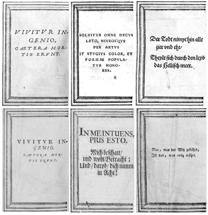
Figure 4 – Images of the woodcuts printed from woodblocks of the Inscriptions from the Skeleton. From Left to right, upper then lower: Fabrica of 1543, Epitome (Latin) of 1543, Epitome (German) of 1543, Fabrica of 1555, Maschenbauer of 1706 and Leveling of 1783

relations with Titian and his studio, Guerra postulates that "Calcar and Vesalius had to consider Marcolini from the start as the potential woodcutter for the Fabrica ." <sup>6</sup>