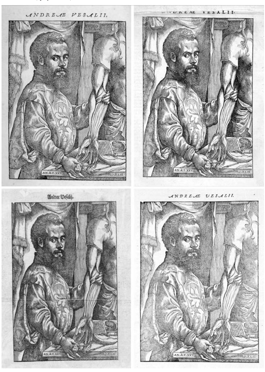
Figure 1: Images of woodcuts from woodblock of the Andreas Vesalius Portrait. From left to right, upper then lower: Fabrica of 1543, Epitome (Latin) of 1543, Epitome (German) of 1543 and Fabrica of 1555

Key words : Anatomy; census; dissection; Epitome; Fabrica; human; Vesalius; printing; illustrations; physicians; universities.