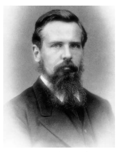
Figure 1: Paul Langerhans (1847 – 1888).

The nineteenth century was the time of a real revolution in science and medicine. A lot of seminal discoveries in medicine and biology were done in this time, and many of them were coincident with the introduction of the compound microscope by Hermann van Deijl and the standard histological technique by Paul Ehrlich. The main tissue types and individual cells were characterized and originally classified more than hundred years ago, although less attention was paid to their basic functions. This was mainly due to the modality of tissue specimen processing that allowed particularly detailed de-